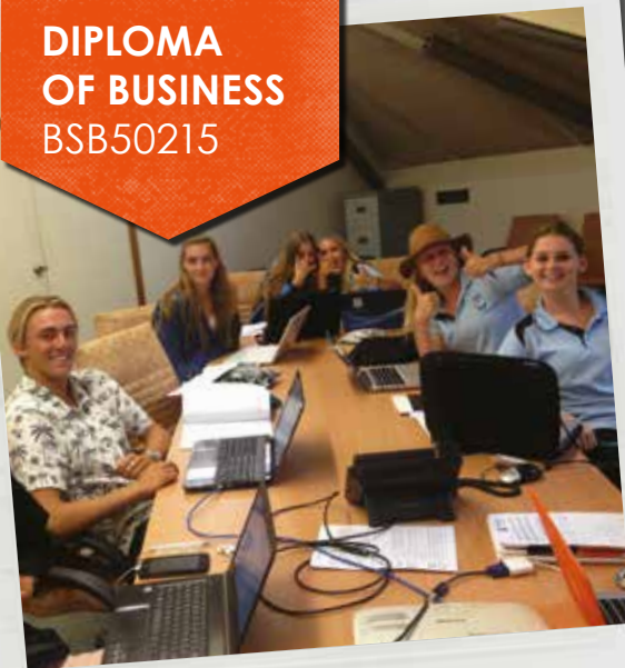
Senior students ready to learn at our Southern Gold Coast Location