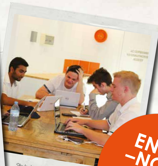
Students at our Southport Campus.